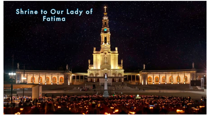
Shrine to Our Lady of Fatima