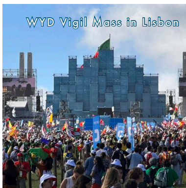
WYD Vigil Mass in Lisbon

It was a truly powerful, eye-opening and unforgettable experience that I will never forget. I am so incredibly grateful beyond words for Gosford Parish's endless support of our pilgrimage – you were there with us the whole journey leading up to it – dinners, raffles, bakestalls, barbeques and all – and you continued to be with us on the journey