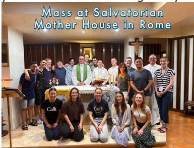
Mass at Salvatorian Mother House in Rome

discipleship, witness and God's love. Each catechesis and Papal speech we attended held thought-provoking kernels of God's word, and every church we visited gave you another chance to really sit down and deepen your spiritual awareness in prayer. My favourite moments of receiving these thought-provoking, Christ-inspired messages would have to be when, of course, Pope Francis instructed us in his