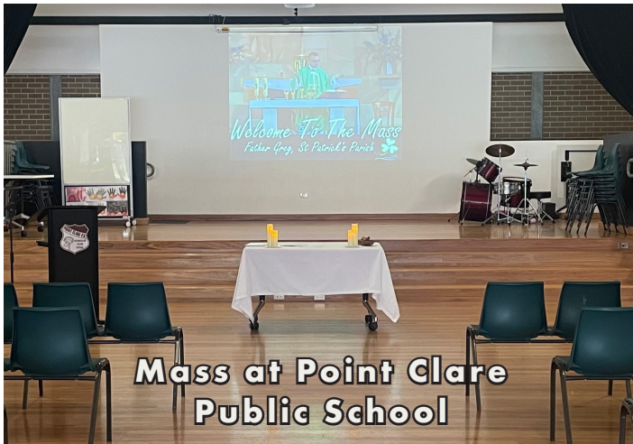
Mass at Point Clare Public School